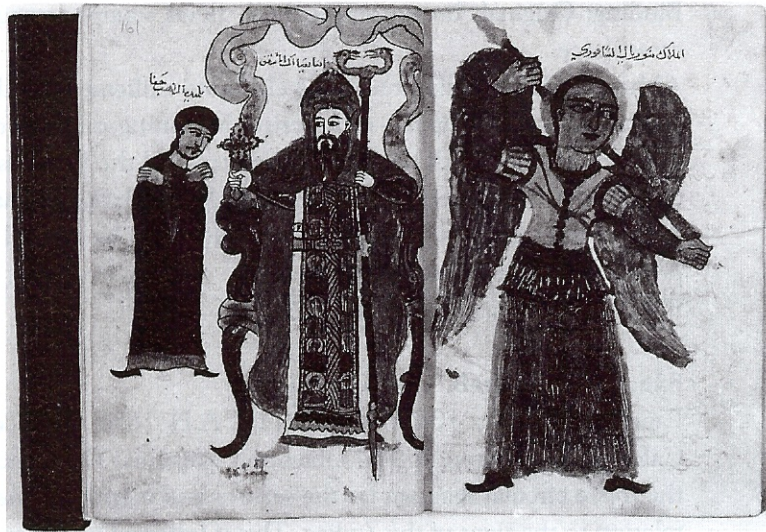
Plate 18. No. 82 (M. Chr. Arab. 71).

Various Christian treatises and theological works, including Saints Lives.