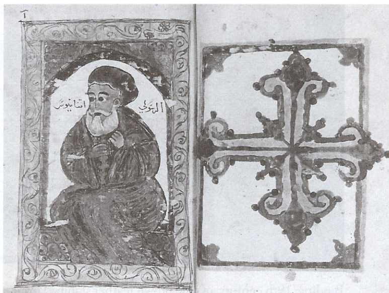
Plate 16. No. 82 (M. Chr. Arab. 71). Various Christian treatises and theological works, including Saints Lives. Fols. 2v-3r: Full-page cross and St. Athanasius. Egypt, 1843.